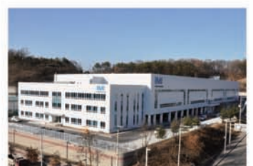
IMI CCI® Korea new manufacturing facility, commissioned in 2015